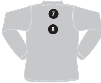
Back Imprint Areas